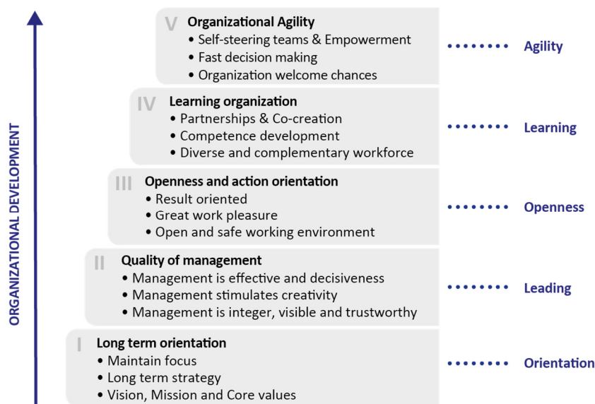
Figure 1 - CIMM Organizational Development (LSSA, 2017)

The first axis focuses on the developing the employees and the organization. Organizational development can relate to the development of products and services, improvement of efficiency, market development, and so forth. CIMM describes the development of leadership, the development of employee's competencies, the development of organizational culture and the way in which the organization is managed.